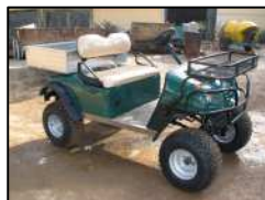
Melex Hi-Rise Farm Utility

Through the implementation of electric vehicles and renewable energy generation, farms and resorts are able to successfully reduce their overall carbon footprint, with solar power generation in sufficient quantity not only to meet the recharge power requirements of the electric vehicle but also to assist in providing surplus electricity generated to the farm or resort – achieving a carbon neutral solution !!!